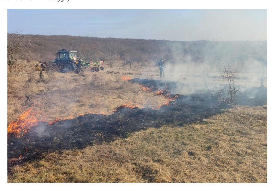
Fig. 1: Initial phase of control burning (backfire) at a locality near Havraníky