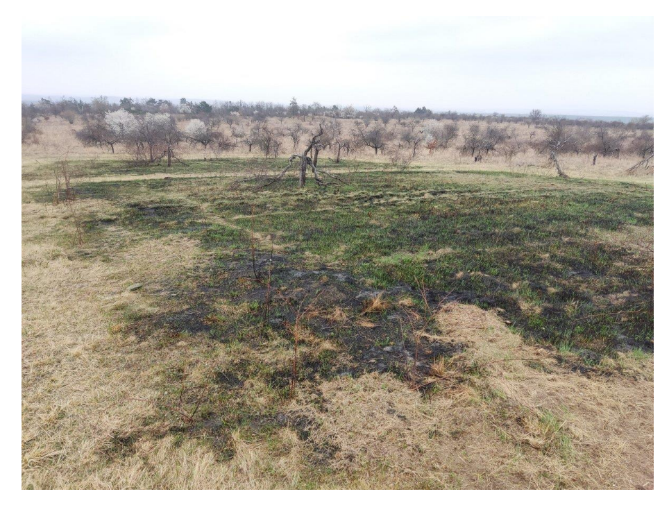
Fig. 3: Fresh grassland at the same plot about 3 months after treatment. Some local plants profit from control burning, such as Verbascum phoeniceum